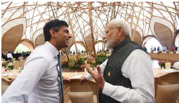
@g20org Summit in Bali." PM Modi's Office said in a tweet.

"Prime Ministers @narendramodi and @RishiSunak in conversation during the first day of the