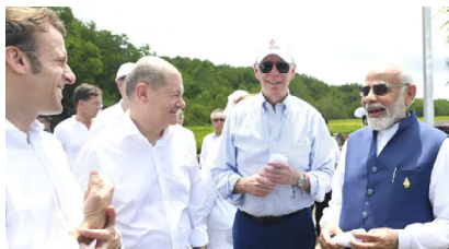
Secretary Vinay Kwatra in his press briefing at Bali.

"The Indian delegation played a big role in achieving consensus among member states over the wording that criticised the Russian invasion, according to three officials with knowledge of the negotiations. The language of the statement echoed Indian Prime Minister Narendra Modi's words to Putin in September by saying 'now is not the time for war and the key role played by India in achieving consensus for the outcome document was clearly spelled out by Foreign